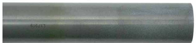
Ceramic outer tube

A combination of high temperature and salt deposit causes a quartz torch to devitrify. Higher concentrations of salt in the samples lead to more rapid devitrification. The quartz torch in the photo was run for only 6 hours with samples containing 10% NaCl and is already badly degraded. By contrast, the ceramic material does not devitrify and is not affected by salt deposits.