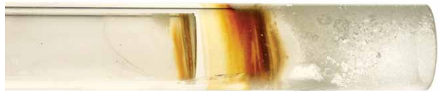
Quartz outer tube