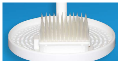
Part T03-7864: P-Tips rack (1000 µL) Holder for cleaning of pipette tips (tray not included). Customized versions available.