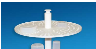
Part T03-786: Additional tray for closures