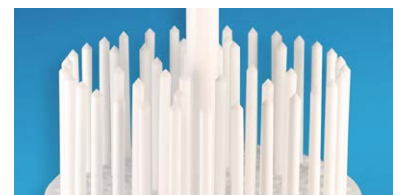
Part T03-7868: 48 additional PTFE rods, height: 120 mm (tray not included)